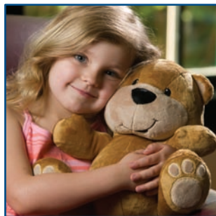
a cuddly companion for any toddler

The Sound Oasis Sleep Bear delivers advanced sound therapy for superior calming of infants and young children.